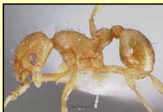
LFA average 2 mm in size

Origin, Distribution, and Habitat: Originally from Central and South America, LFA have been found on the Island of Hawai'i. Only one known population exists on Kaua'i in Kalhiwai. Please report any sightings of this ant immediately!