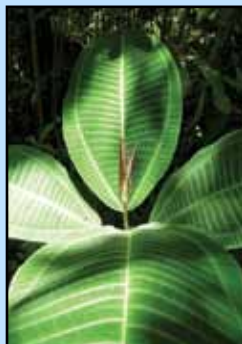
Maui Invasive Species Committee