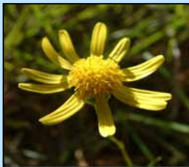
Kauai Invasive Species Committee

Fireweed is a daisy-like herb that grows up to 2' high. The stem is upright and slender with bright green leaves. The leaves are smooth, very narrow (only ¼" wide), have serrated edges, and they reach about 5" long. The small yellow flowers have 13 petals and are about the size of a nickel. The mature flowers turn into white thistle-balls.