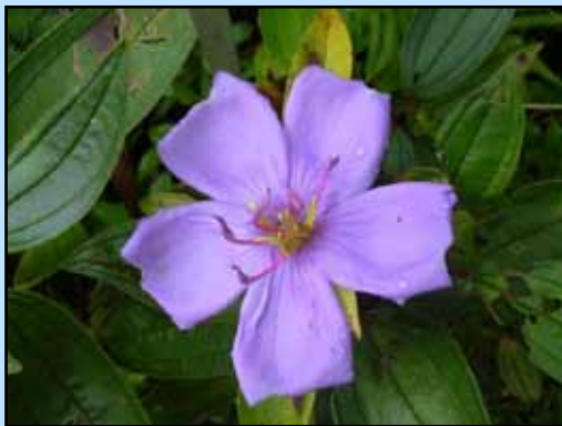
Glorybush has large purple flowers