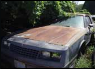
Maui Invasive Species Committee

Ivy gourd smothers anything in its path, including coconut trees and abandoned vehicles