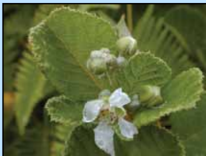
Flowers also have prickles