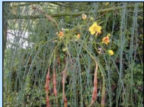
Forest & Kim Starr (USGS)

Impacts: This pest has spread throughout the world as an ornamental tree and has since escaped from cultivation. Jerusalem thorn is fast-growing, drought tolerant, and able to grow in different soil types. In Australia, Jerusalem thorn can form dense thorny impenetrable thickets along water-courses and drainages.