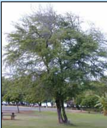
Forest & Kim Starr (USGS)

Kiawe is the common, thorny mesquite found in dry and coastal areas of Kaua'i. It grows up to 40' tall, has 1" thorns, and yellow seed pods. Kiawe can be differentiated by its long, yellow to white flowers.