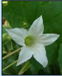
Kaua'i Invasive Species Committee

Origin, Distribution, and Habitat: Ivy gourd is native to Africa, India, Asia, and Australia. It has been found on all Hawaiian Islands with the exception of Moloka'i. On Kaua'i, ivy gourd escaped from gardens and can be found in Anahola, Moloa'a, L'hu'e, Shipwrecks, and Kekaha. Please report any new sightings of ivy gourd to stop the spread of this pest!