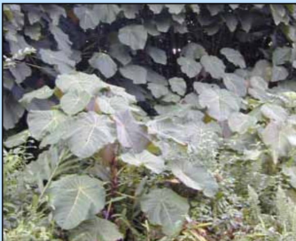
Forest & Kim Starr (USGS)

General Description: Bingabing is a large-leaved plant that grows 15' to 30' tall. Its round leaves can be as large as an umbrella, up to 2' to 3' long. The stem attaches to the middle of the leaf. Bingabing flowers do not have petals. Instead, there are noticeable red bracts along the main stem.