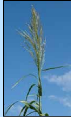
Alternate leaf arrangement