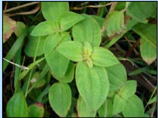
Forest & Kim Starr (USGS)