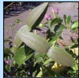
Flowers are funnel-shaped with five petals