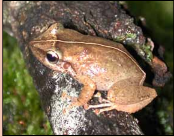
S Chun and AH Hara (UH CTAHR)

Adult coqui frogs average 1" long, similar in size to a quarter. Their color ranges from light brown, dark brown, and red and may have a line running down their back. They have a broad, rounded snout and obvious toe pads.