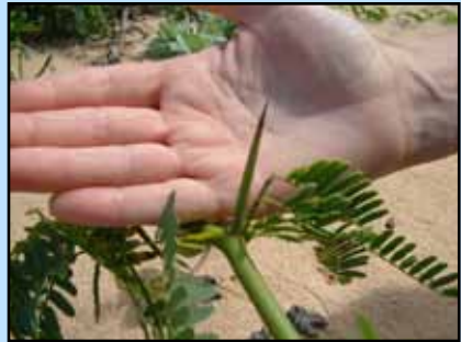
Long-thorn kiawe has 4" long thorns

Impacts: The long-thorn kiawe thorns are able to pierce entirely through rubber slippers, boots, and car/truck tires. These thorns also have poison-tipped ends that can cause bruises and swelling. The long-thorn kiawe grows in dense thickets that crowd out native coastal plants. It is capable of rendering large areas impassible, preventing beach access.