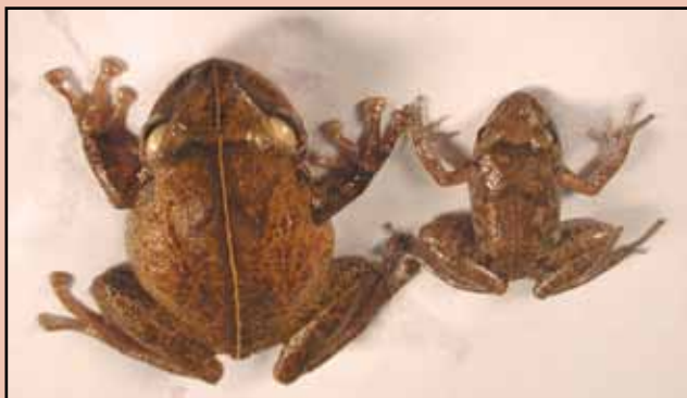
Greenhouse frogs (left) have more claw-like toes compared to coqui frogs (right)

The invasive greenhouse frog is widespread on Kaua'i. Adult greenhouse frogs are about the size of a dime whereas coqui frogs are larger, about the size of a quarter. They also have a different