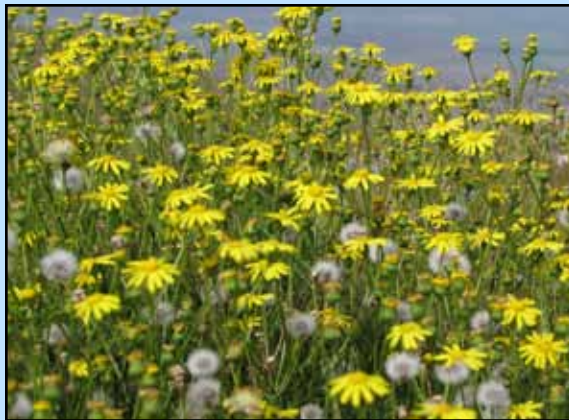
Forest & Kim Starr (USGS)

Impacts: Fireweed invades pastures, disturbed areas, and roadsides. It is very toxic to cattle, horses and other livestock. When ingested it causes illness, slow overall growth, liver-malfunction and even death in severe cases. In Australia, fireweed costs over $2 million per year in losses and control.