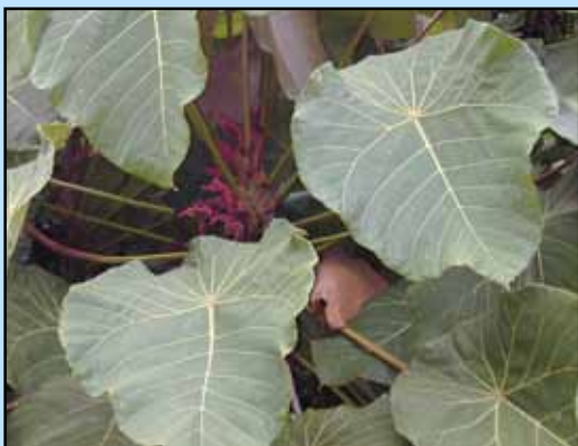
The stem attaches to the middle of the leaf