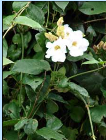
Forest & Kim Starr (USGS)

Blue trumpet vine is a fast-growing vine. It has thin stems and smooth, opposite-growing leaves. It produces blue-violet to white flowers. The leaves are pointed compared to ivy gourd.