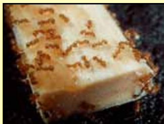
LFA on a chopstick