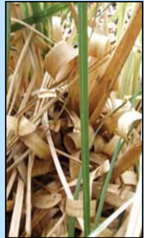
Dried corkscrew-shaped leaves