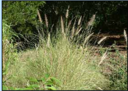
Fountain grass is a large clumping grass

Origin, Distribution, and Habitat: Fountain grass is native to Africa. In Hawai'i, it invades many types of natural areas including bare lava