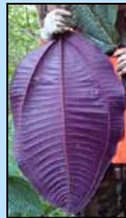
Kauai Invasive Species Committee

Leaves can be 3' long by 1' wide with a green top and purple underside