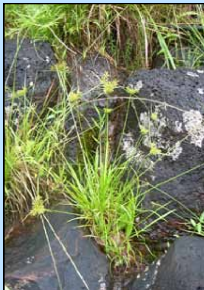
Forest & Kim Starr (USGS)

Native Hawaiian sedges may be confused with young pampas grass plants