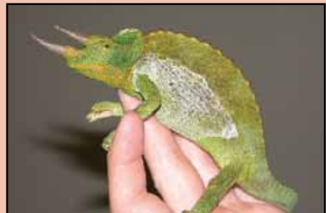
Male Jackson's have three horns on their head