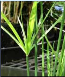
Forest & Kim Starr (USGS)

Japanese mat rush is an invasive rush commonly seen on Kaua'i. It has round narrow stems unlike the flat stems of cattail. It also lacks the cigar like flowers of cattail.