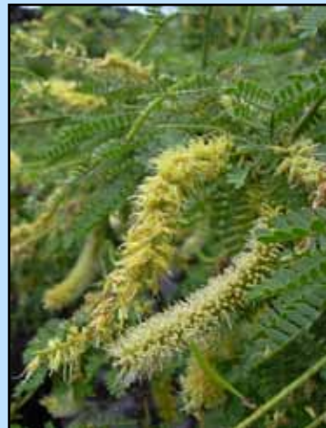
Forest & Kim Starr (USGS)

Kiawe has long, yellow to white flowers (top) and can grow taller than Jerusalem thorn