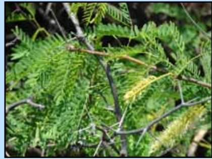
Long-thorn kiawe's pale yellow flowers are cylinder-shaped spikes

General Description: Long-thorn kiawe can grow as a rambling shrub or tree ranging from 6' to 30' tall. The thorns are up to 4" long. Its pale yellow flowers are numerous and grow in cylinder-shaped spikes up to 4" long. Mature seed pods are flat, curved, yellowish brown and 3" – 8" long.