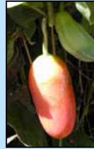
Forest & Kim Starr (USGS)