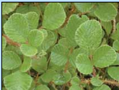
The leaves have a saw-like edge and rounded tip