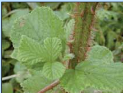
Yellow Himalayan raspberry has hundreds of prickles along its stem

Origin, Distribution, and Habitat: Yellow Himalayan raspberry is native to tropical and subtropical India. On Hawai'i Island, this pest is now naturalized in moist to wet, disturbed forests from 2,270' to 5,580' elevation. It is well adapted to open sunny areas and wet shady rainforests. On Kaua'i, there is no known infestation.