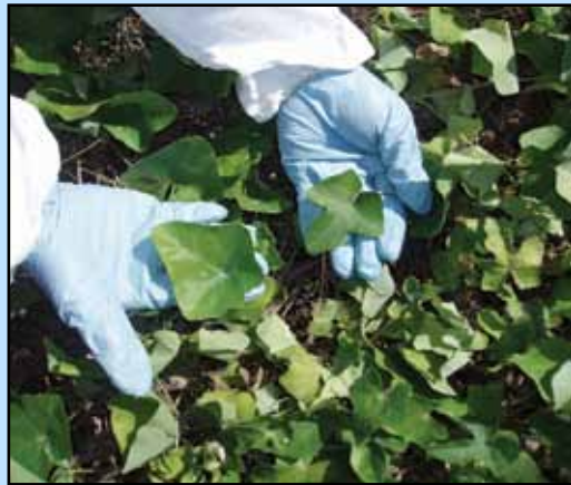
Maui Invasive Species Committee