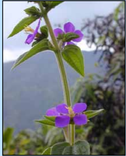
Forest & Kim Starr (USGS)