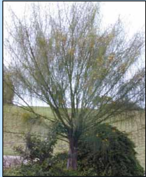
Forest & Kim Starr (USGS)

Jerusalem thorn is a shrubby, thorny tree that grows 9' to 30' tall. It has a smooth green bark and spines along its branches. Feathery leaves are formed by long flat spine-like stems and it has 22 – 30 pairs of small leaflets measuring 10" to 16" in length. Jerusalem thorn has small 1" yellow flowers with orange spots. The flowers hang in groups. This plant has green pods with brown or purple spots that range from 2" to 8" long.