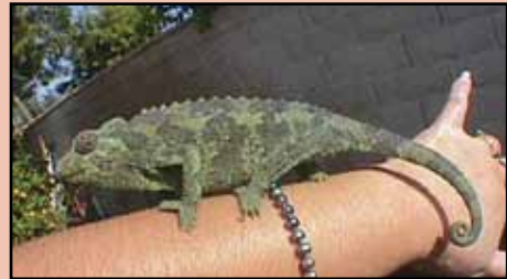
Female Jackson's chameleons do not have a sharkfin-like shield on their head

Jackson's chameleons grow up to 10" in length. Adult males have three horns on the top of their heads. Juveniles and females often have a blotchy color. This look-alike is considered invasive on Kaua'i. Please report sighting of the Jackson's chameleon immediately!