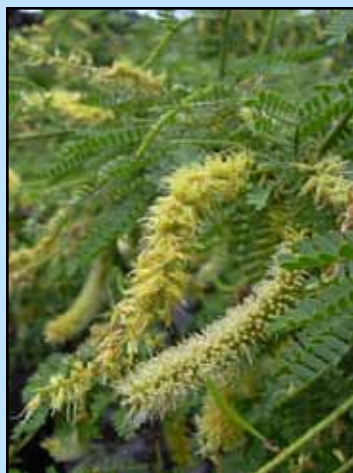
Forest & Kim Starr (USGS)

Common kiawe has yellow to white flowers (right) and small thorns (top)