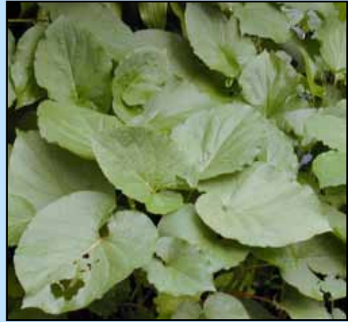
Some false kava stems are red and the leaves have a red tint

Dispersal Mechanism: False kava is spread by humans who mistakenly plant it as true kava. Seeds are dispersed by birds and possibly bats. Plants also spread rapidly by suckers. Small pieces