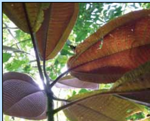
Maui Invasive Species Committee

Leaves can be 3' long by 1' wide with a green top and purple underside