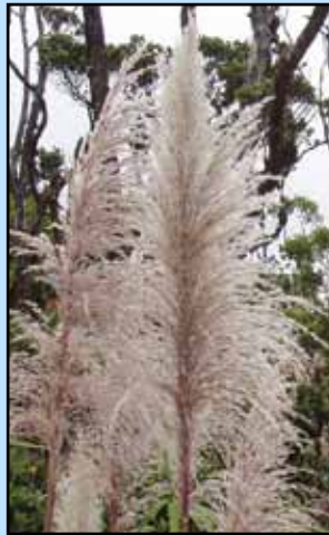
Pampas grass flower

Historically, the invasive nature of C. selloana was not recognized in Hawai'i because only female plants were cultivated and sold.