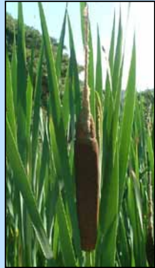
Cattail flowers cluster into a cigar shape. The leaves slightly twist at the top

Cattail is native to many areas of the world in freshwater wetlands, marshes, lakes, coastland, and riparian and estuarine habitats.