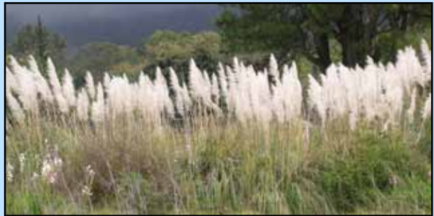
Pampas grass flower plumes hold thousands of seeds that may blow up to twenty miles away