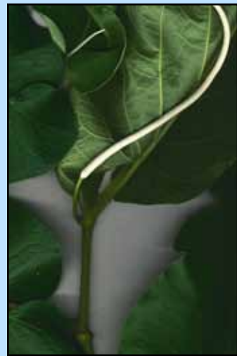
False kava tightly-packed flowers form a long, arching spike