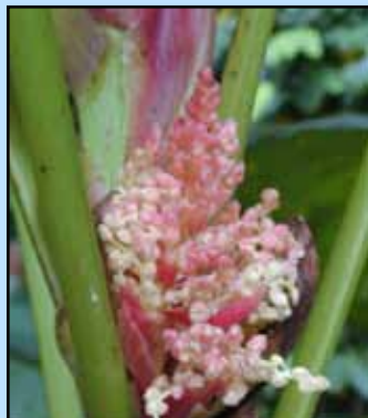
Red bracts are located along the main stem of bingabing