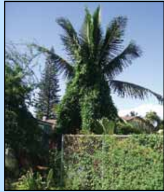
Maui Invasive Species Committee

Ivy gourd smothers anything in its path, including coconut trees and abandoned vehicles