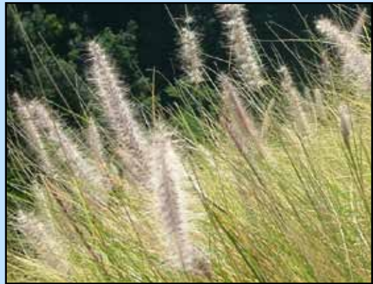
Long purple inflorescences have hundreds of seeds