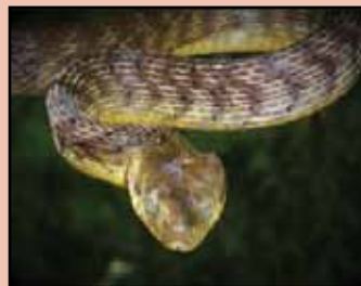
Brown tree snake

Snakes are not native to Hawai'i and are illegal. Should a brown treesnake or other snake enter Hawai'i and establish a breeding population, our island's economy, ecology, and way of life will be irretrievably altered. Illegal pets can be turned in, no questions asked, by calling the Pest Hotline at 643-PEST. If you EVER see a snake, call 911 immediately!