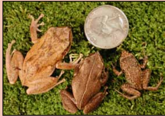
S Chun and AH Hara (UH CTAHR)

Impacts: These small tree frogs are known for the male's loud "ko-kee" mating call which can reach up to 90 decibels, interrupting the evening peace for residents and visitors. Coqui have no natural predators in Hawai'i and can reach population densities of up to 10,000 frogs per acre. They have a voracious