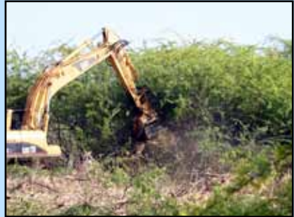
Long-thorn kiawe grows in dense thickets

Dispersal Mechanism: Long-thorn kiawe produces thousands of seeds per year, which are carried long distances by water. The trees easily resprout after damage.